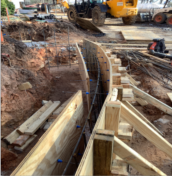
Continue constructing modular walls