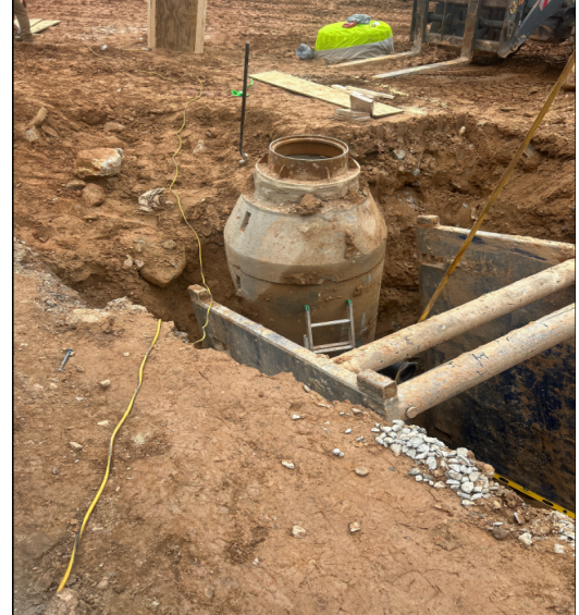
Continue installing sanitary sewer system