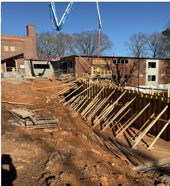
Continue to pour back concrete retaining wall