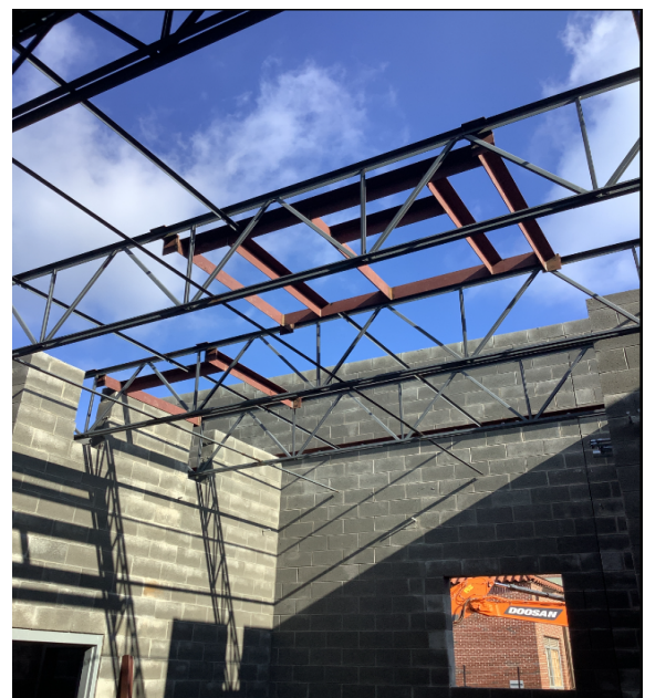
Complete joist and decking system install at the new kitchen addition